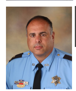
REGION 3 REPRESENTATIVE