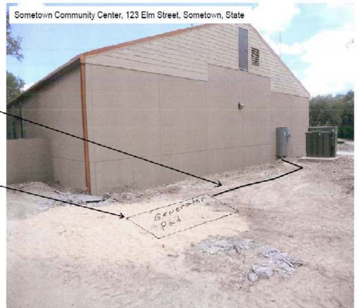
Figure 4. Ground-level photograph showing proposed ground disturbance area.