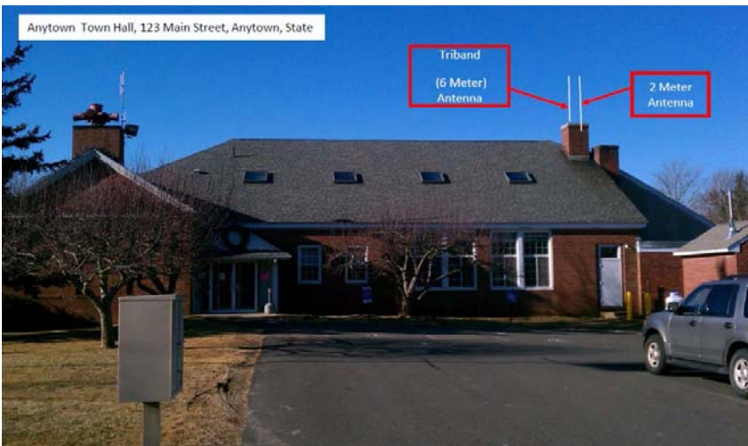
Figure 2. Example of ground-level photograph showing proposed attachment of new equipment.

Ground-level photographs. The ground-level photograph in Figure 2 supplements the aerial photograph in Figure 1, above. Combined, they provide a clear understanding of the scope of the project. This photograph has the name and address of the project site, and uses graphics to illustrate where equipment will be installed.