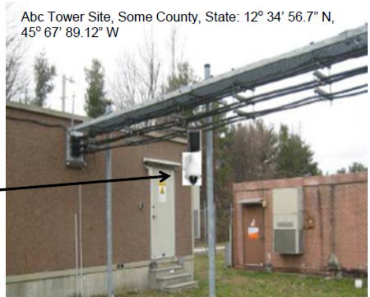
Figure 3. Ground-level photograph with graphic showing proposed equipment installation.

Ground-level photograph with excavation area close-up. The example in Figure 4 shows the proposed location for the concrete pad for a generator and the ground disturbance to connect the generator to the building's electrical service. This information can be illustrated with either an aerial or ground-level photograph, or both. This example has the name and physical address of the project site.