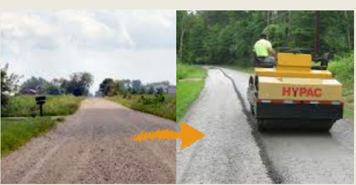
GRAVEL ROAD ADDING ASPHALT