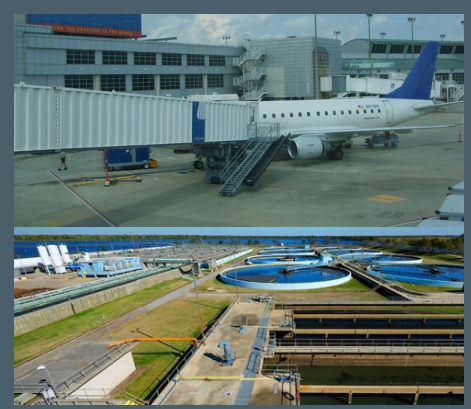
ALTERNATE PROJECT – USE FUNDS FROM OUTDATED STORM DAMAGED AIRPORT TO EXPAND A WASTE WATER TREATMENT FACILITY

You have two (2) options that may help you better utilize your project funding . . . an Alternate or an Improved project. [44 CFR 206.203(d) and PA Guide FEMA 322]