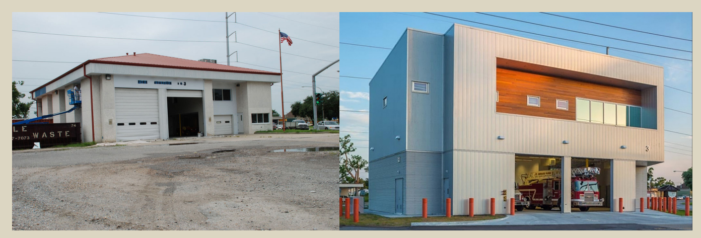
ST. BERNARD IMPROVED PROJECT - CHANGING A ONE-STORY FIRE STATION TO A TWO-STORY FIRE STATION