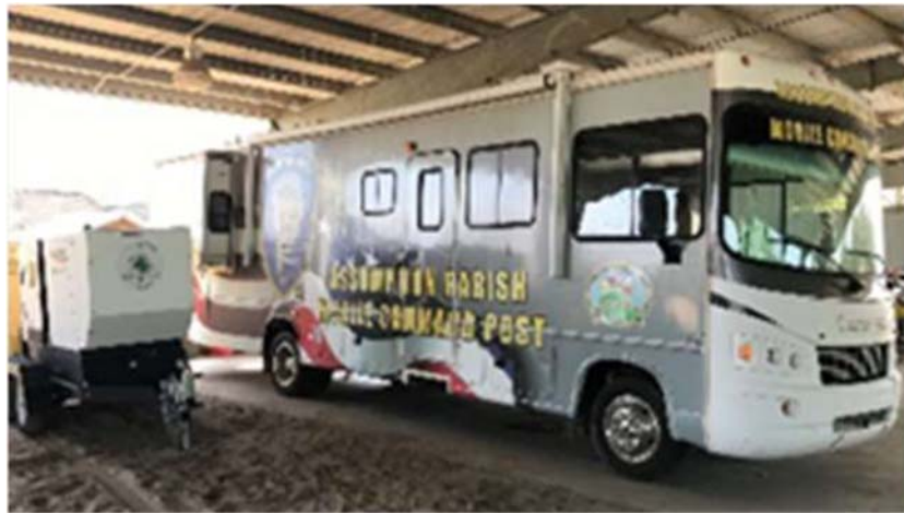
Figure G-4: Assumption MCP (R3)