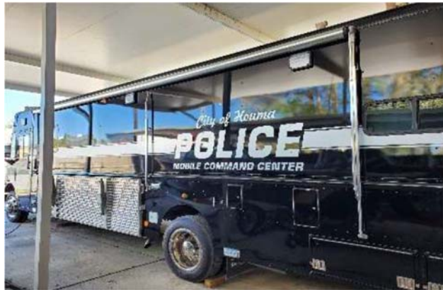
Figure G-5: Houma PD MCC (R3)