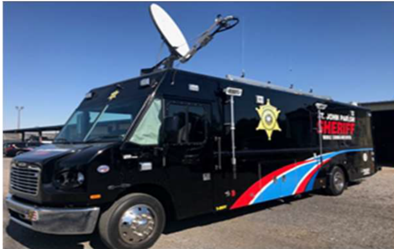
Figure G-9: St. John SO MCC (R3)