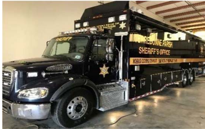
Figure G-10: Terrebonne Parish SO MCU (R3)