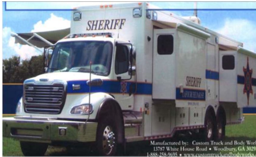
Figure G-6: LPSO MCV 320 (R3)